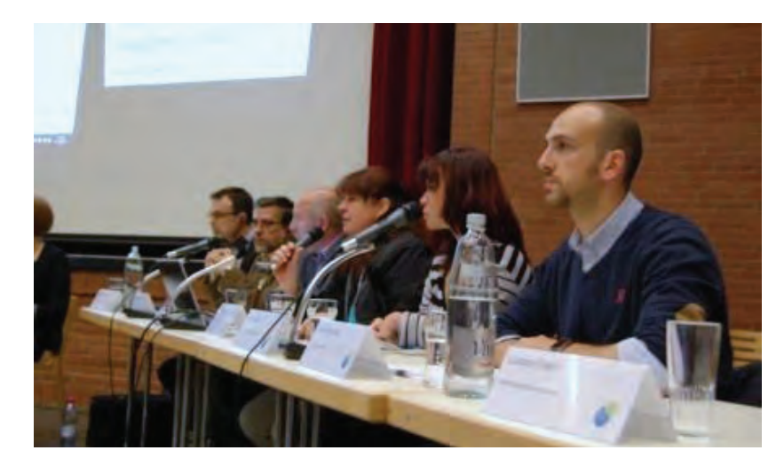
Photo: public conference about the Design for All approach in municipalities; speakers from the City, from Info-Handicap, and participants from the workshop

The implementation of accessibility in Luxembourg was led by the driving force and the strategic support provided by Centre National Info-Handicap. The great effort on accessibility enhancement began in 1995 from the need to improve the accessibility of trains and railway stations: Info-Handicap started a collaboration with the national society of Luxembourg rail systems (Société des Chemins de Fer Luxembourgeois – CFL), in order to assert the rights of people with disabilities to accessibility.